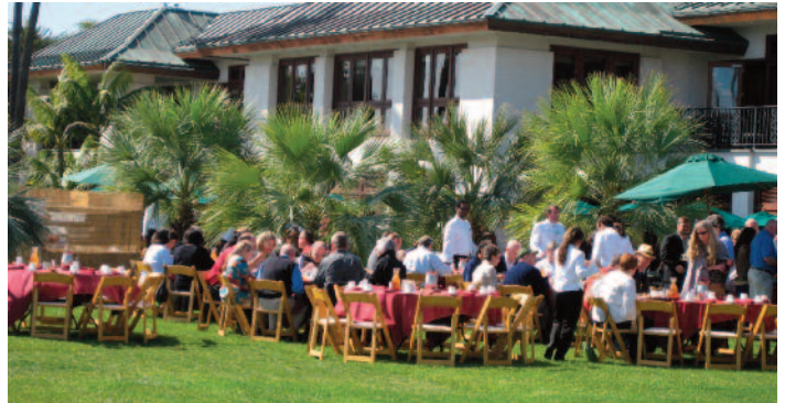
There was time for lunch and networking near the bay!

Presentations from site assessors included updates on methods and method development for beryllium, diacetyl, and acetoin. Finally, presentations on TEM and ICP-MS were provided.